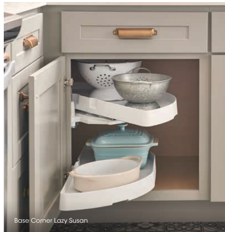
Base Corner Lazy Susan