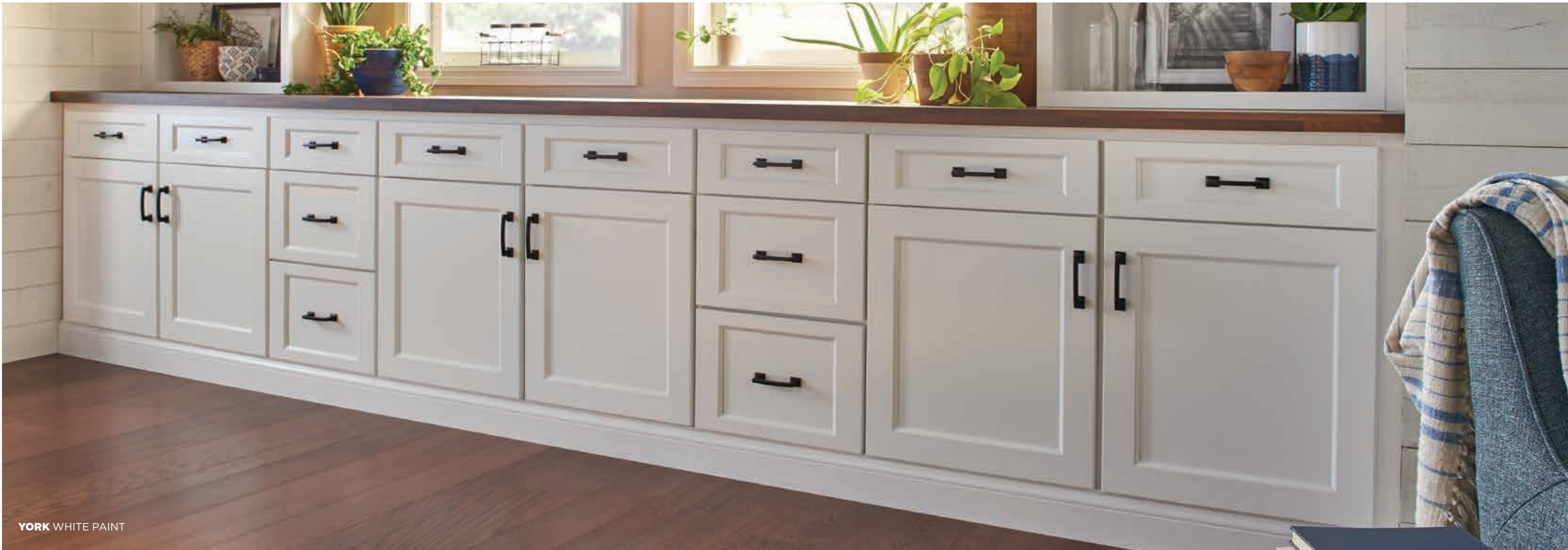
YORK WHITE PAINT