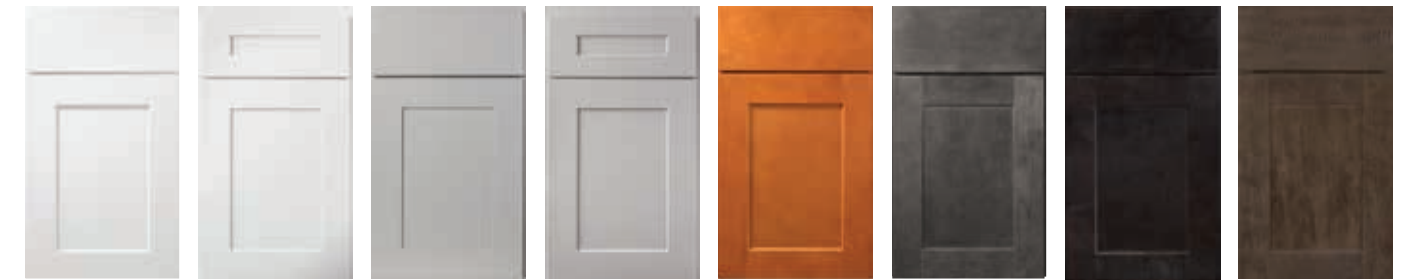
White Paint White Paint 5-Piece Pewter Paint Pewter Paint 5-Piece Honey Stain Grey Stain Dark Sable Stain Brownstone Stain