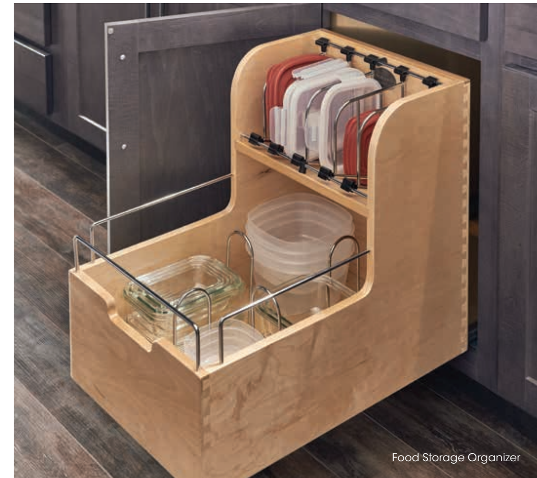
Food Storage Organizer