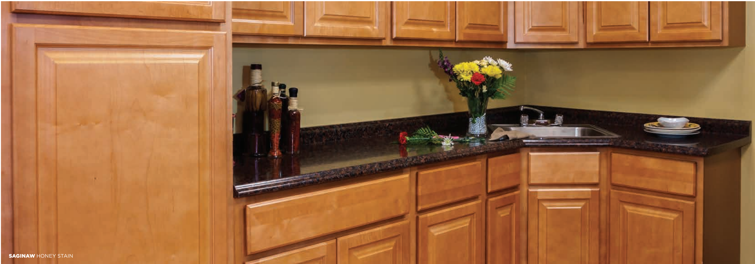
SAGINAW HONEY STAIN