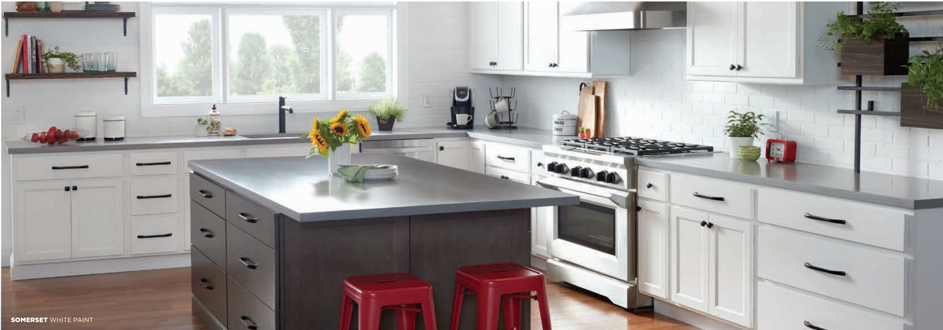
SOMERSET WHITE PAINT