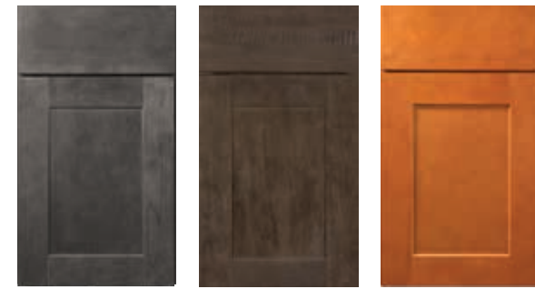
Grey Stain Brownstone Stain Honey Stain