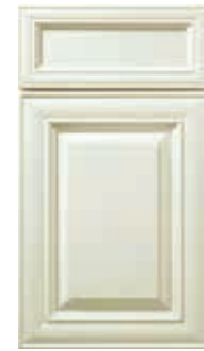
Antique White Paint