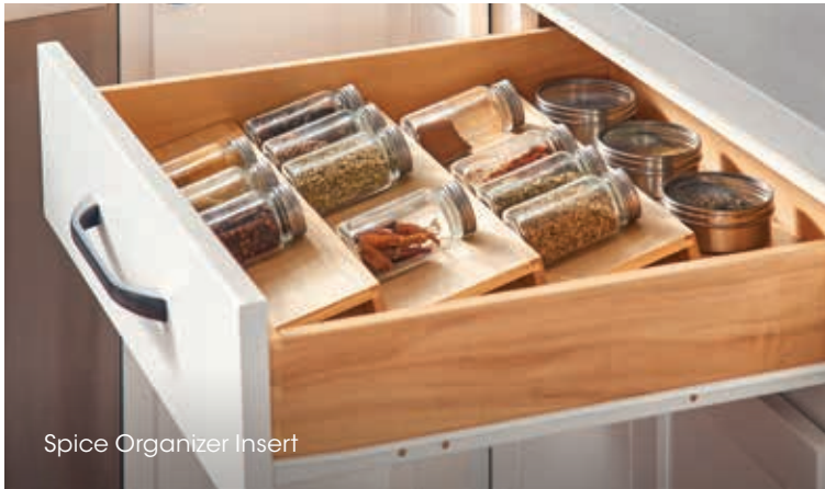
Spice Organizer Insert