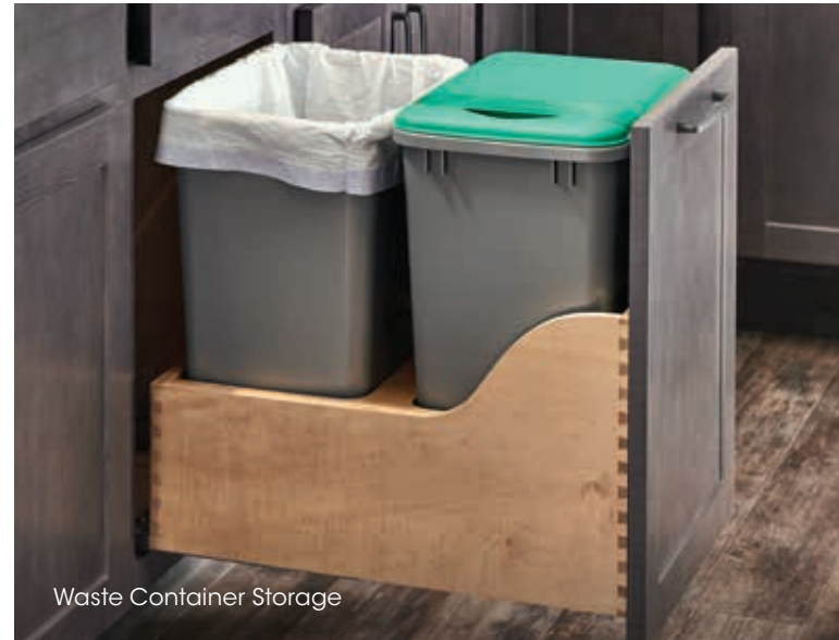
Waste Container Storage