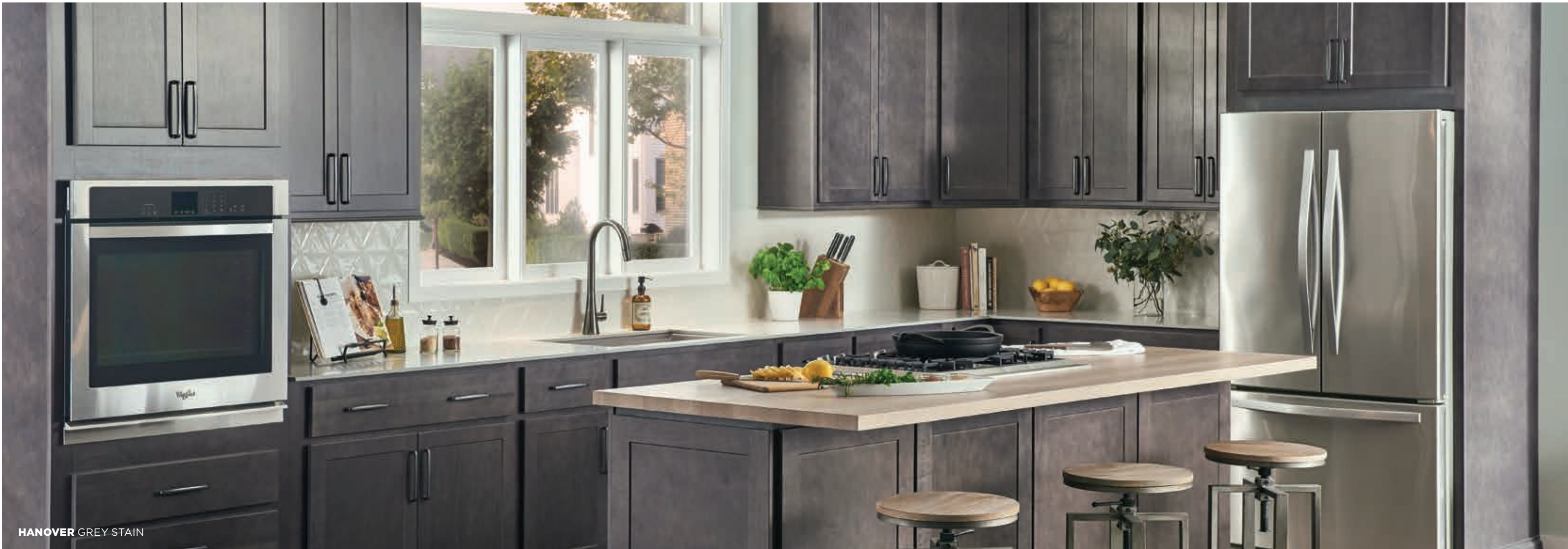
HANOVER GREY STAIN