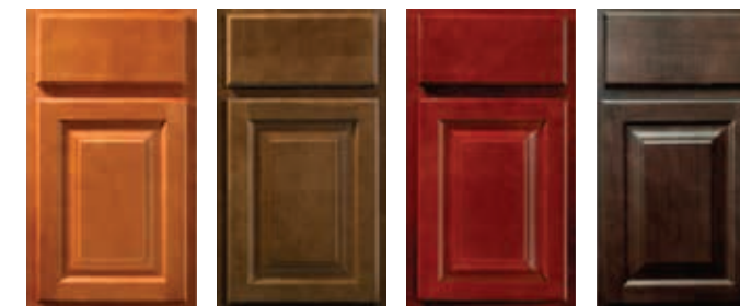
Honey Stain Chestnut Stain Crimson Stain Dark Sable Stain