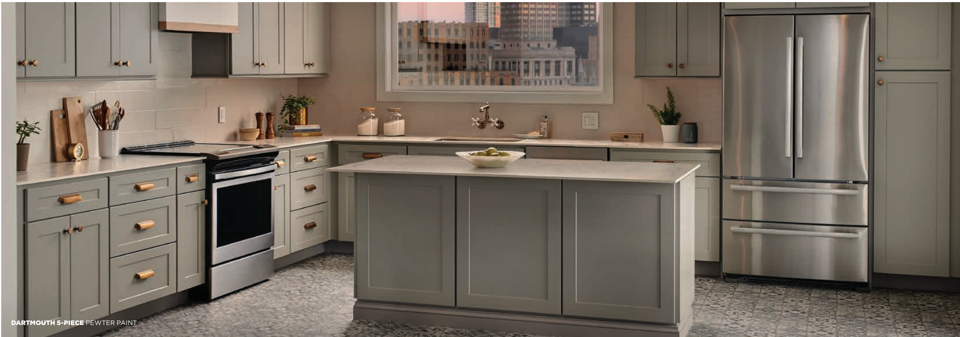
DARTMOUTH 5-PIECE PEWTER PAINT