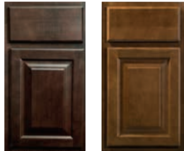
Dark Sable Stain Chestnut Stain