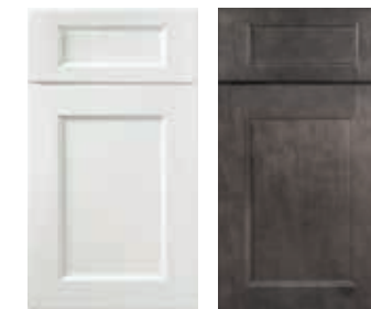
White Paint Grey Stain