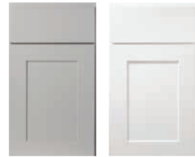
Pewter Paint White Paint