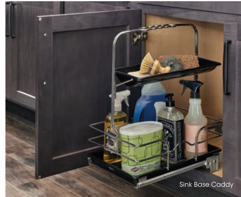
Sink Base Caddy