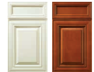
Antique White Paint Heritage Brown Stain with Chocolate Glaze