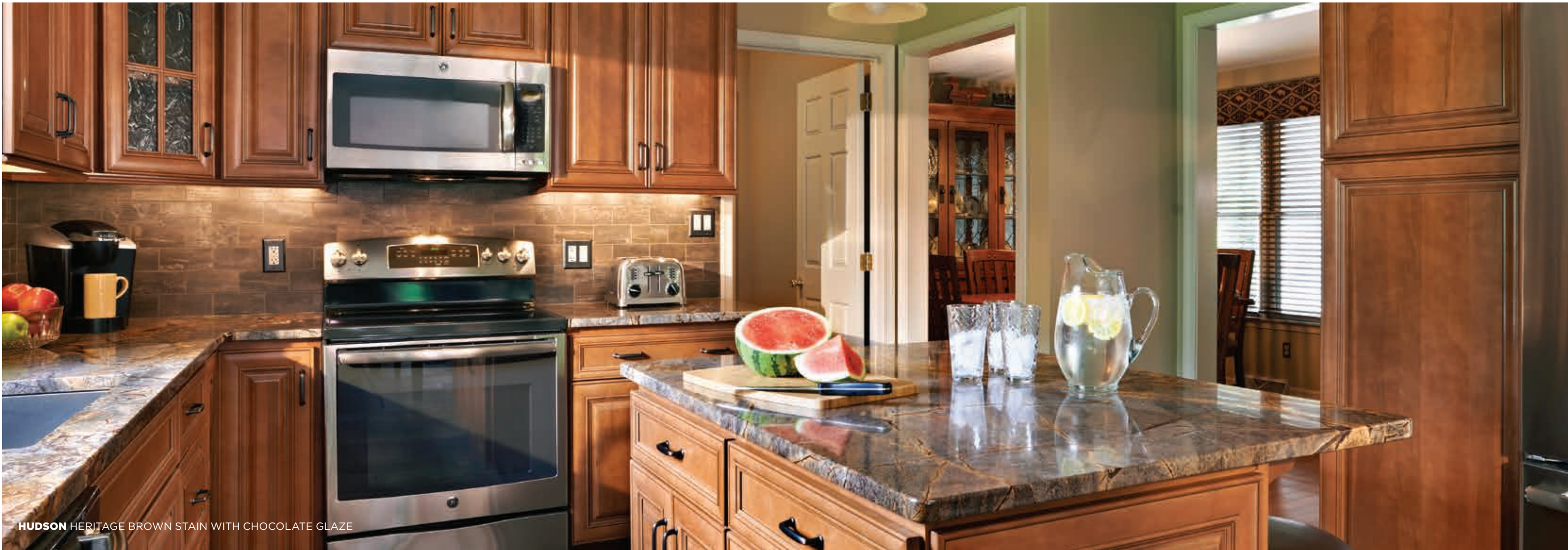
HUDSON HERITAGE BROWN STAIN WITH CHOCOLATE GLAZE