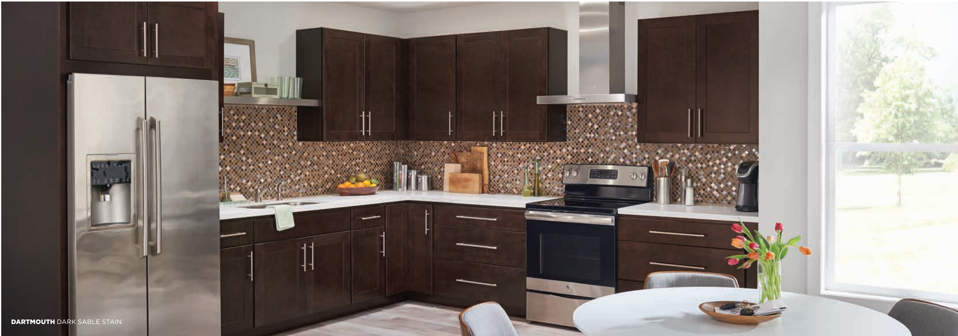
DARTMOUTH DARK SABLE STAIN