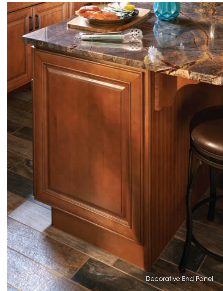
Decorative End Panel