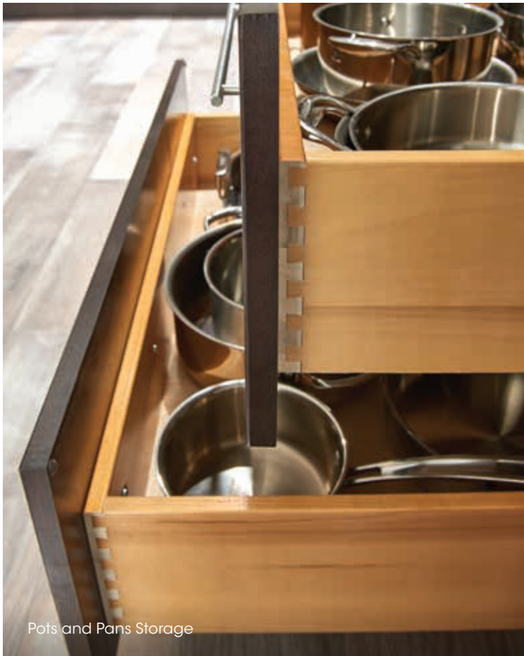
Pots and Pans Storage